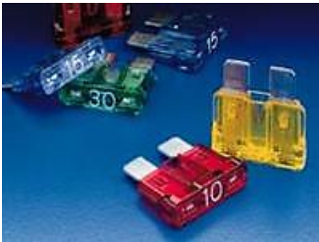
ATO automotive fuses

The two most common components used to protect brake circuits are automotive fuses and positive temperature coefficient thermistors (PTCs).